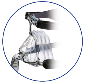
Cushions are Easy to Attach & Remove