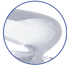
Extra comfort cushion